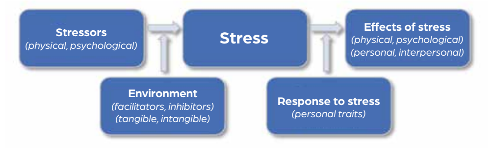
Figure 1 The Relationship Between Causes and Effects of Stress